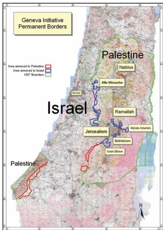
GENEVA INITIATIVE MAP A study in “chartjunk.”

Israelis and Palestinians who support a two-state solution desperately need a positive picture that captures and bolsters their fragile conviction that peace is possible. If Israelis and Palestinians talk peace again, getting the maps right will require a collaborative process of drafting and redrafting by the agreement’s authors together with cartographers and graphic designers. This process would produce better graphics, and it would reveal new ways of seeing and therefore thinking about the agreement. It is well known that writing forces us to confront the limits of our own understanding, exposing logical gaps and unresolved