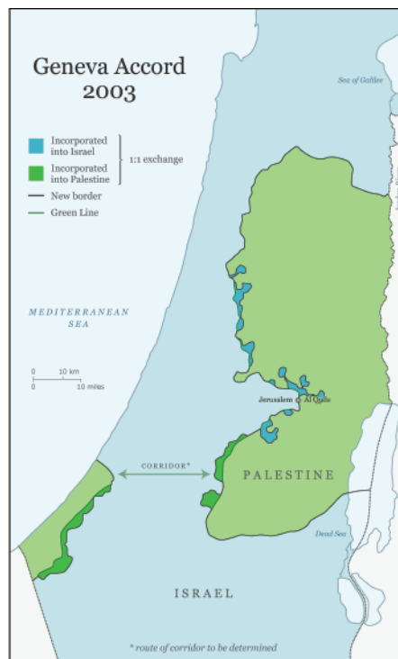
MOTRO/CORUM GENEVA MAP Peace as possible.

to the verbal “to be determined” language in the text of the Geneva agreement.