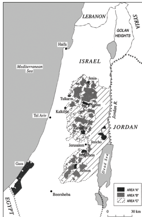
MOTRO/CORUM OSLO II MAP A two-state vision of Oslo II. SAVIR OSLO II MAP The diplomat's view.

ator Dennis Ross's memoir, The Missing Peace , I recently produced an alternative vision of Oslo II.